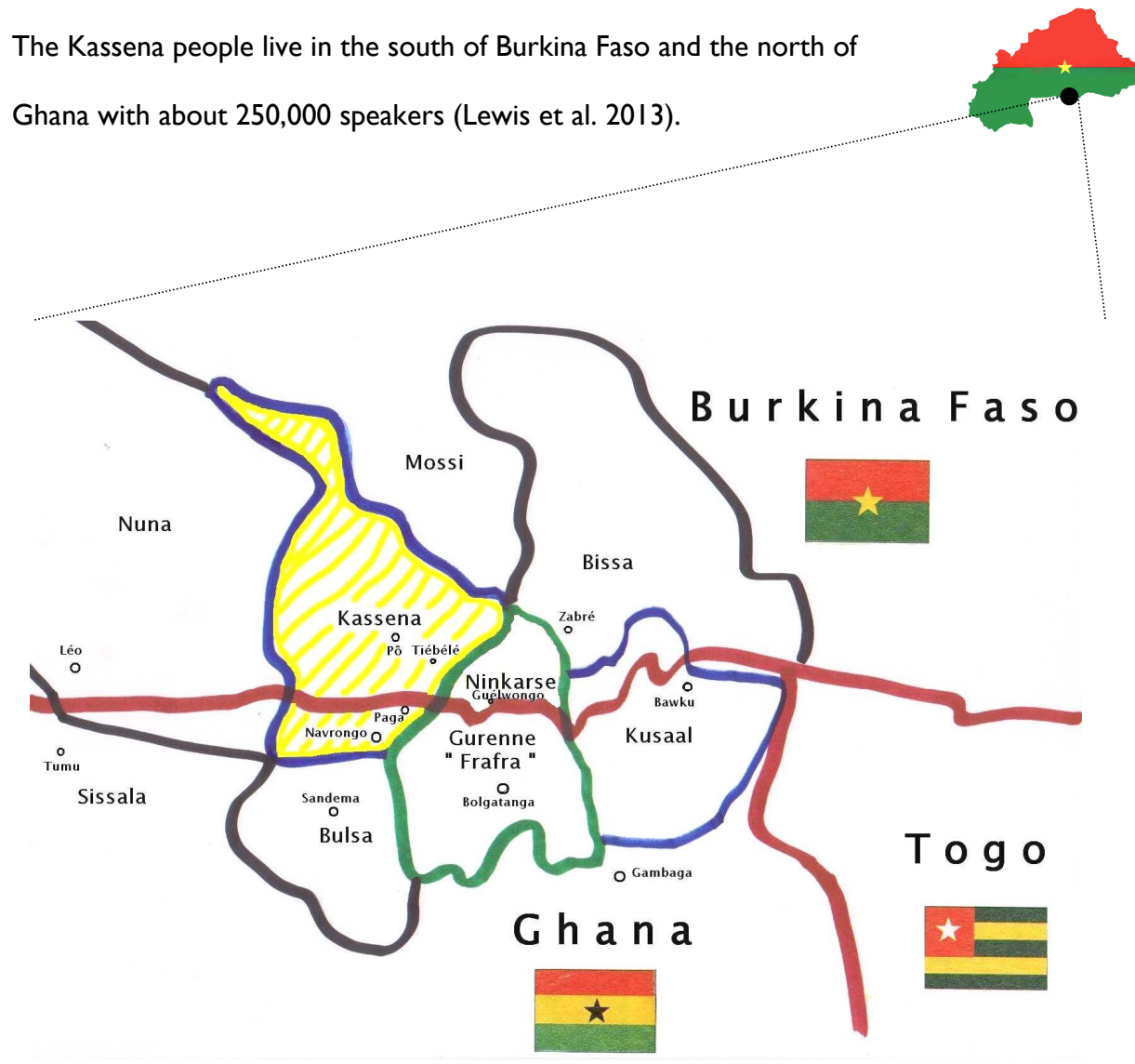
Figure 1: Location of Kassena people

My wife and I lived in a Kassena village called Tiébélé for seven years (1987 to 1995) and studied their language and their culture as well as doing language development and translation of the New Testament in Kassem (see <a href="www.Kassena-Ninkarse.org">www.Kassena-Ninkarse.org</a>). During our work we were confronted with the question of how to translate the concepts of 'spirit' and 'soul'. To answer this we needed to find out whether in the Kassena perception a person consisted of three parts: body, soul and