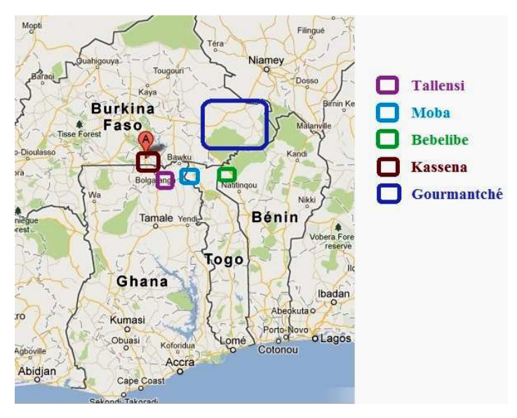
Figure 2: Google Map, showing 5 language areas, adapted by Urs Niggli

Fortes Tallensi for Koabike Moba for Merz Bebelibe for Niggli Kassena for Swanson for Gourmantché (Components for computers)